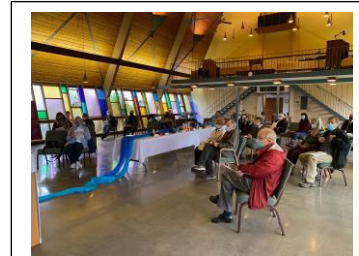
All Saints' Sunday Liturgy