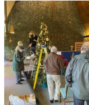
And ready for Christmas