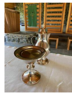
The congregation prepares for return to in-person worship; 23 June /21