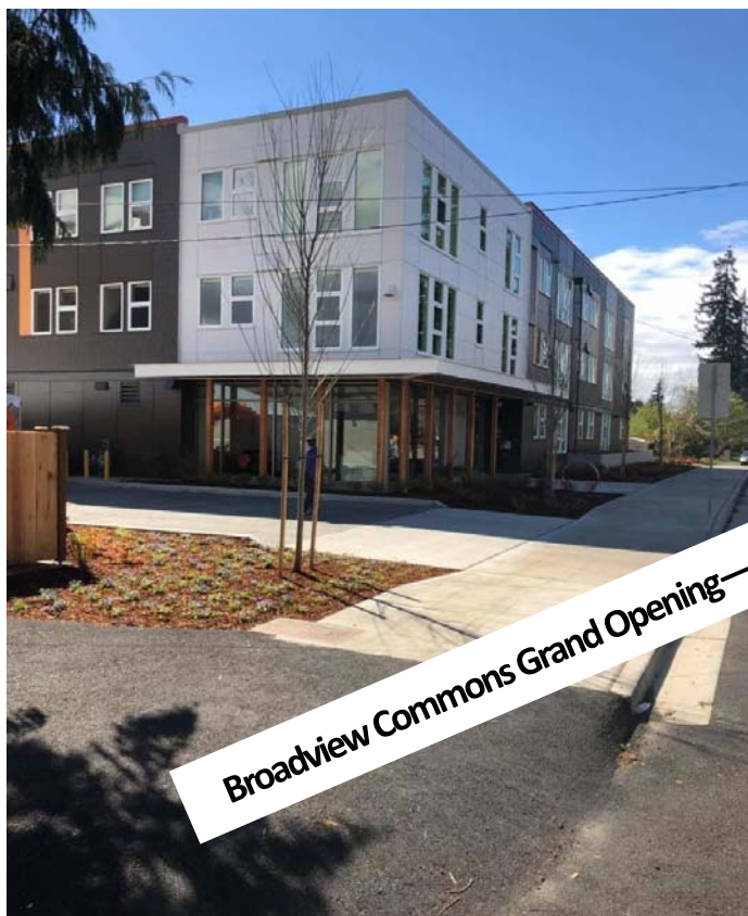
Broadview Commons Grand Opening—April 12, 2019