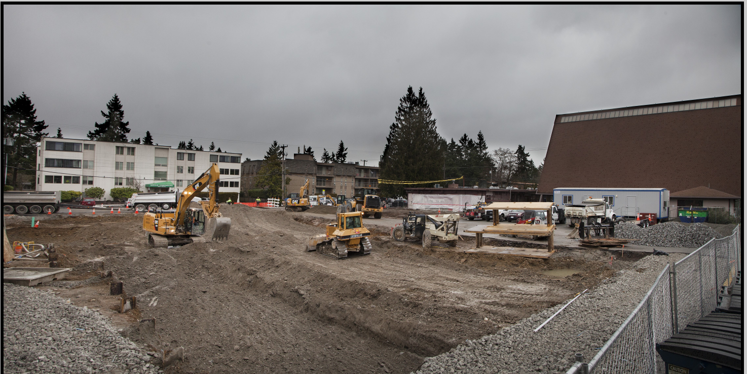
Image is from the SW corner of the property, looking back toward Luther Memorial.

All are welcome at Luther Memorial. Come join us for worship every Sunday at 10:30 am!