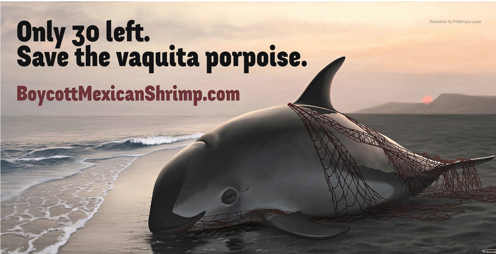
Illustration by Frédérique Lucas